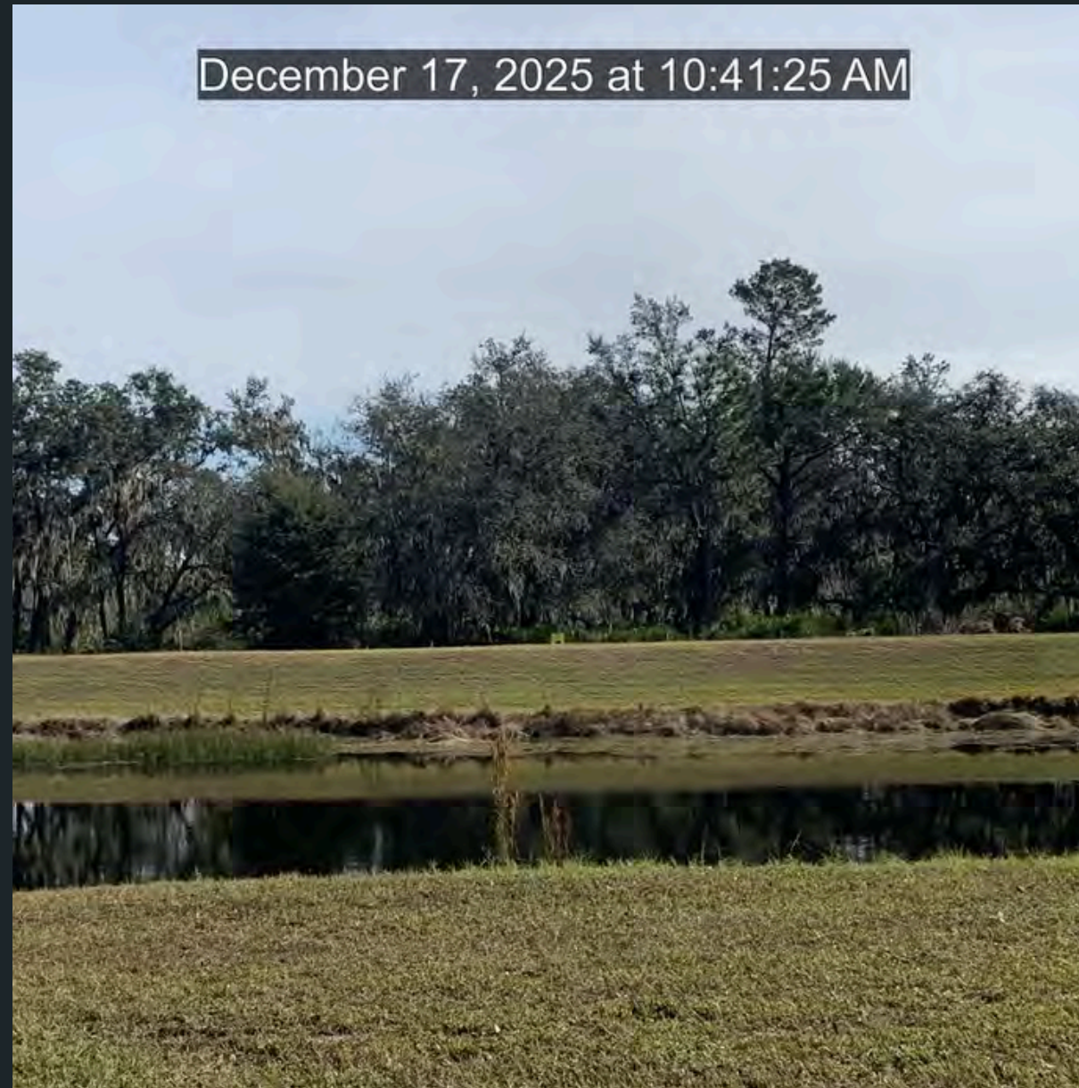
Pond #C Treated for Algae and Shoreline vegetation.