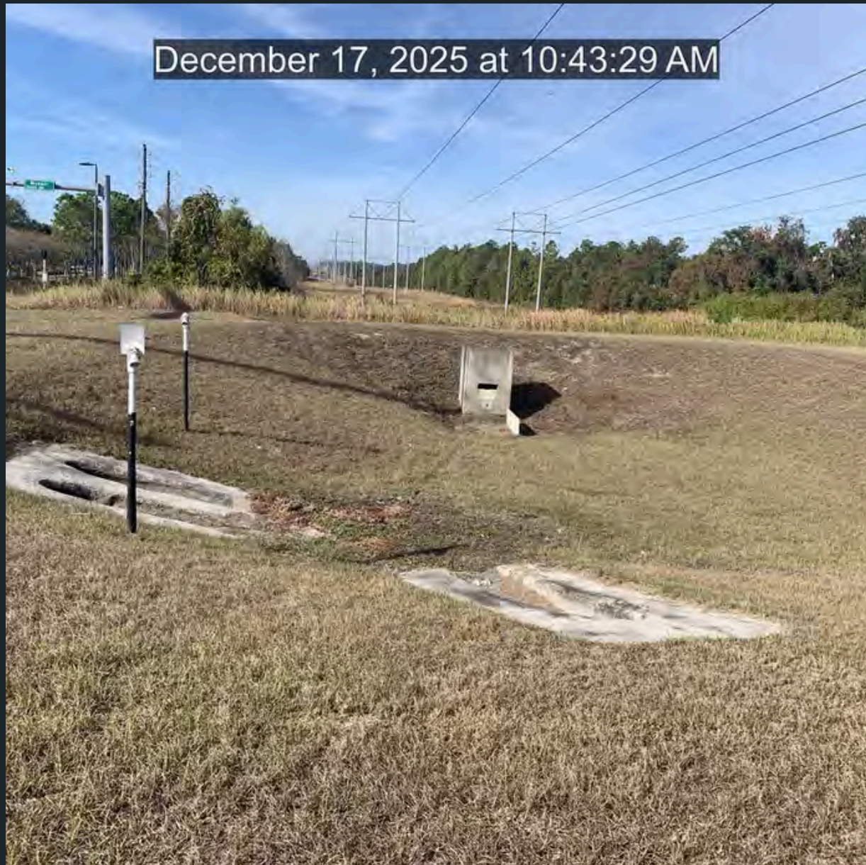
Pond #4A Treated for Shoreline Vegetation.