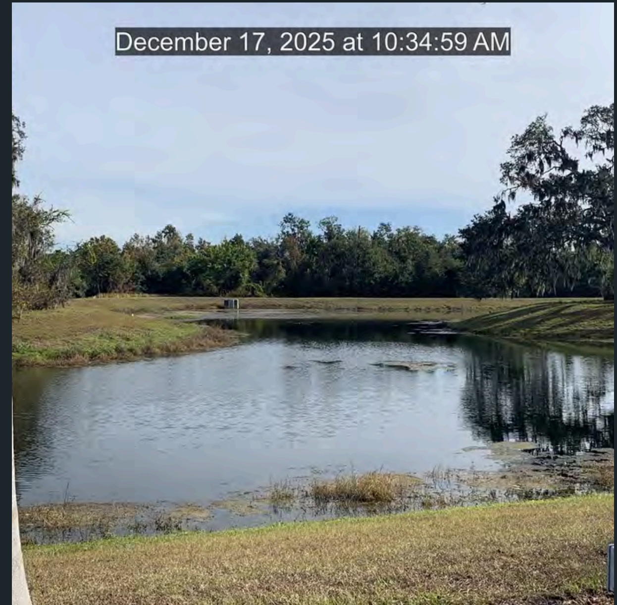
Pond #D1 Treated For Algae and Shoreline Vegetation.