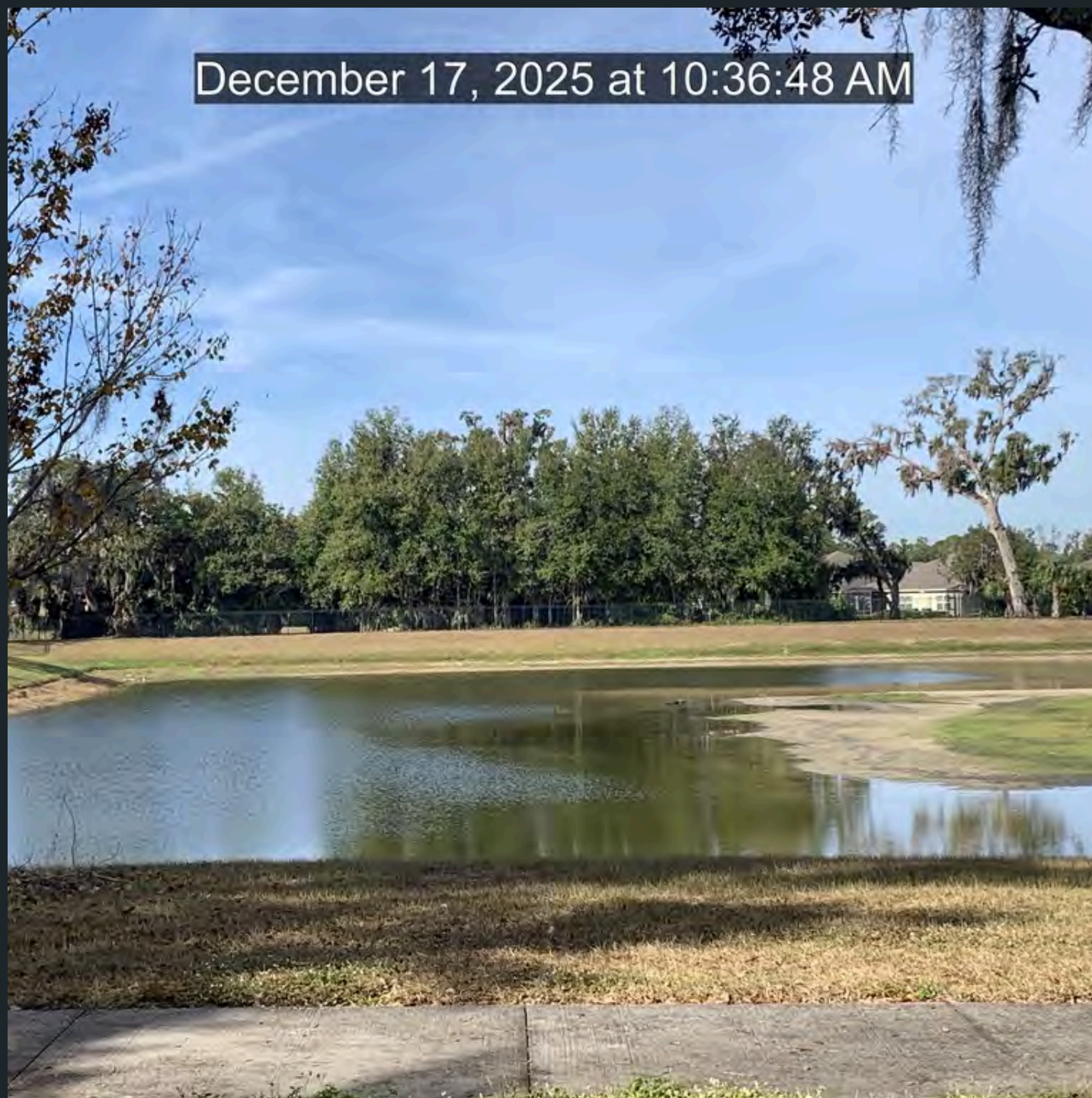
Pond #E Treated for Algae and Shoreline Vegetation.