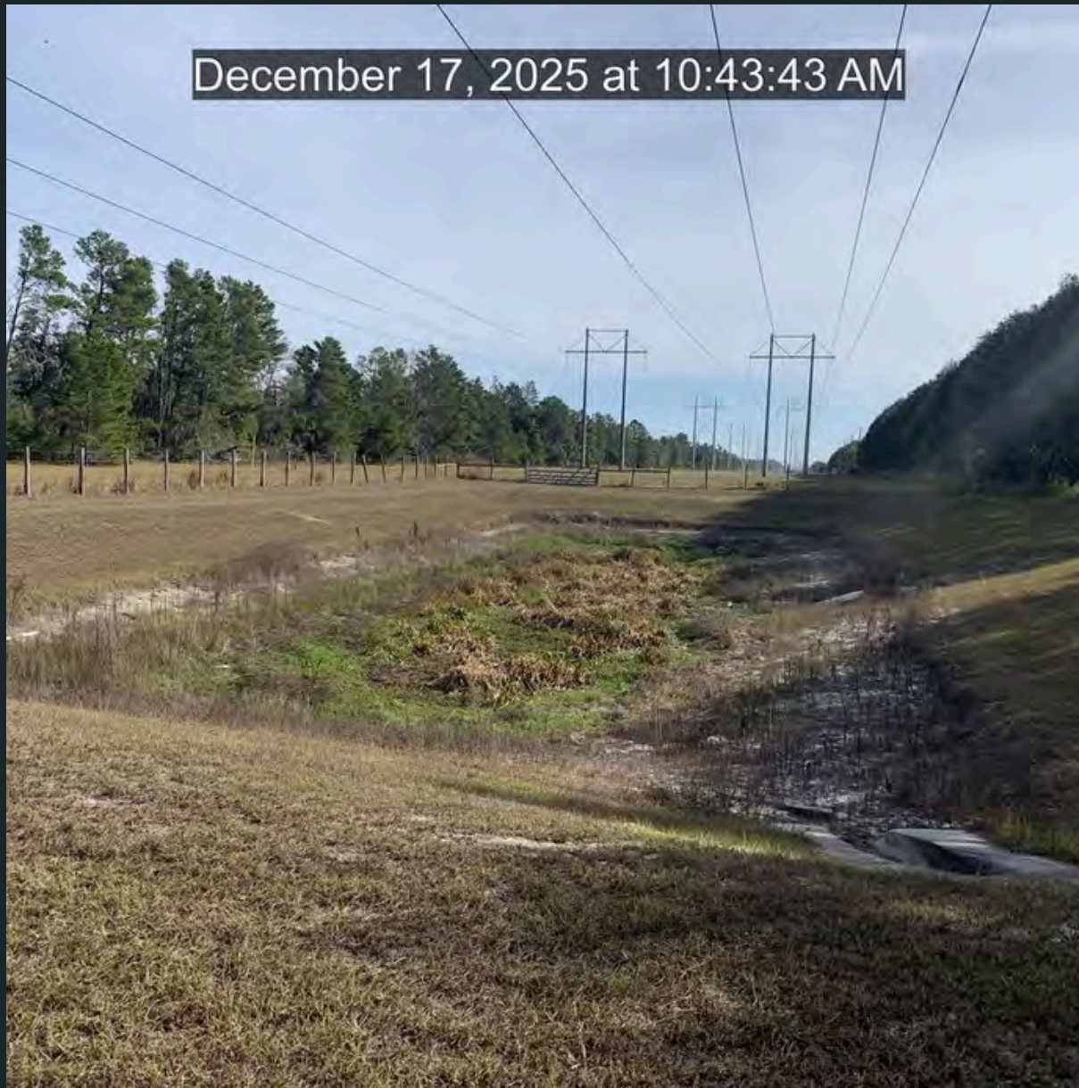
Pond #4B Treated for Shoreline Vegetation.