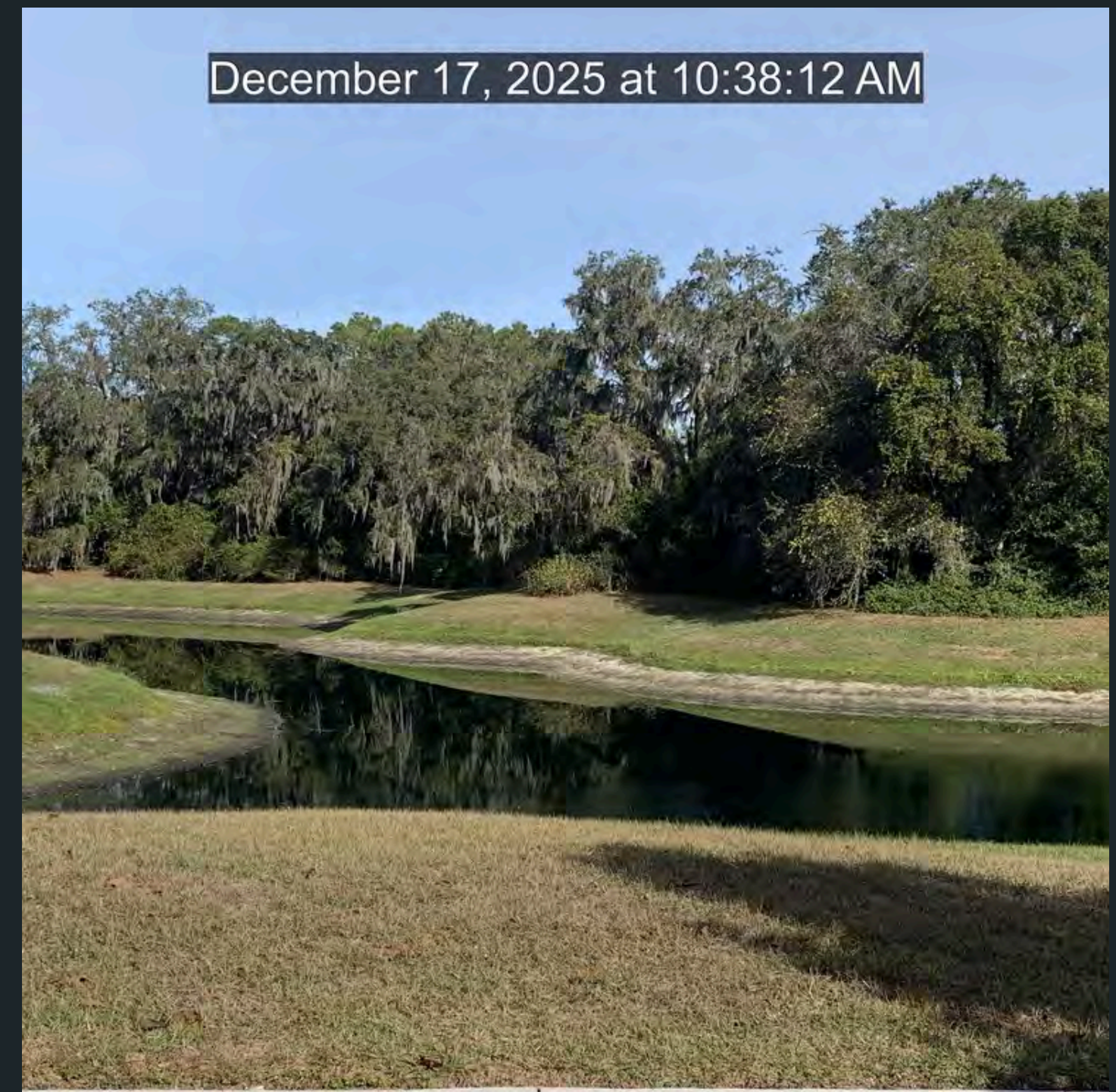
Pond #400 Treated for Algae and Shoreline Vegetation.