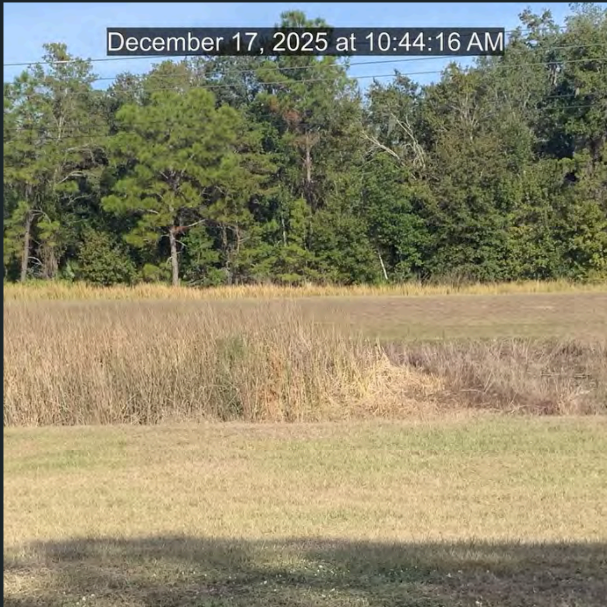
Pond #3 Treated for Shoreline Vegetation.