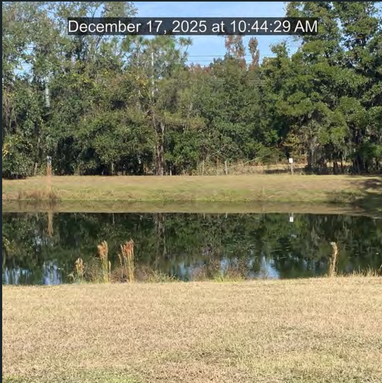
Pond #2 Treated for Algae and Shoreline vegetation.